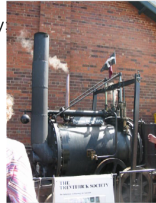
A replica of Richard Trevithick's 1801 road locomotive 'Puffing Devil'

The first automobile suitable for use on existing wagon roads in the United States was a steam-powered vehicle invented in 1871 by Dr. J.W. Carhart, a minister of the Methodist Episcopal Church, in Racine, Wisconsin . [1][11][self-published source] It induced the State of Wisconsin in 1875 to offer a $10,000 award to the first to produce a practical substitute for the use of horses and other animals. They stipulated that the vehicle would have to maintain an average speed of more than 5 miles per hour (8 km/h) over a 200-mile (320 km) course. The offer led to the first city to city automobile race in the United States, starting on 16 July 1878 in Green Bay, Wisconsin , and ending in Madison, Wisconsin , via Appleton , Oshkosh , Waupun , Watertown , Fort Atkinson , and Janesville . While seven vehicles were registered, only two started to compete: the entries from Green Bay and Oshkosh. The vehicle from Green Bay was faster, but broke down before completing the race. The Oshkosh finished the 201-mile (323 km) course in 33 hours and 27 minutes, and posted an average speed of six miles per hour. In 1879, the legislature awarded half the prize. The alphabet cars: 1903: Model A 1904: Model B, C & AC 1905: Model F 1906: Model K & N 1907: Model R & S 1908: Model T (introduced as a 1909 model) (To be continued)