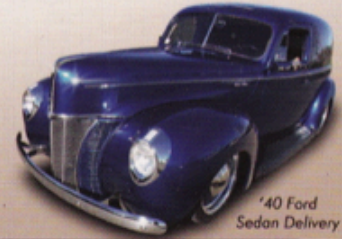
'40 Ford Sedan Delivery

760-740-2400 fax 760-740-8700 info@cgfordparts.com www.CGFordparts.com